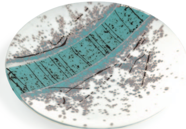
Plate by Patty Gray beautifully illustrates the reaction of Turquoise Frit on Red Reactive Opal